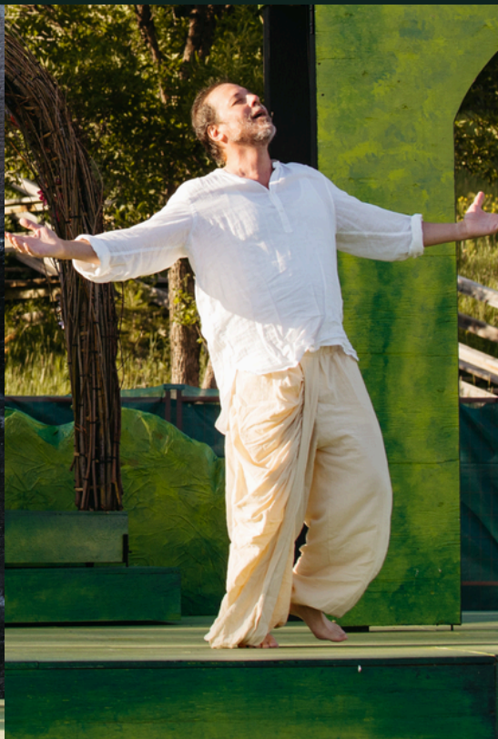
This is ROSALIND dressed as GANYMEDE