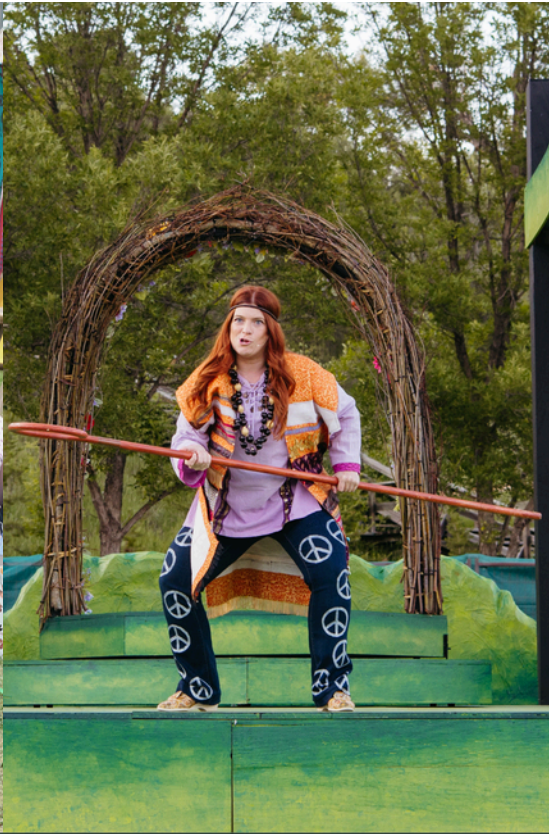
This is MARTEXT