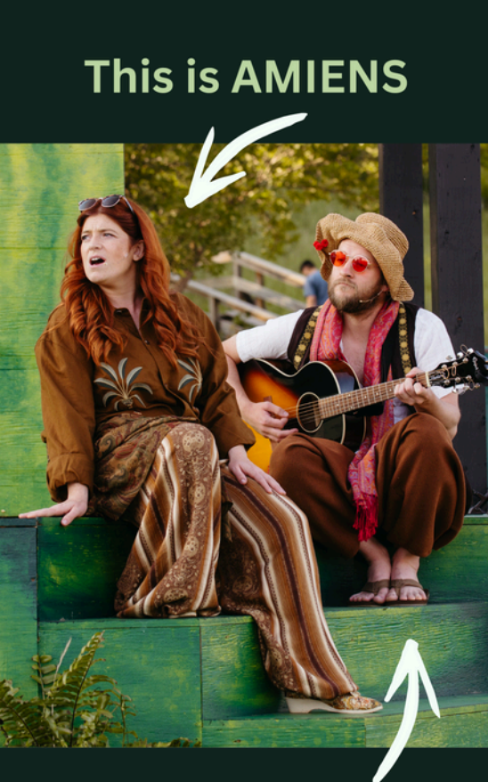
This is AMIENS