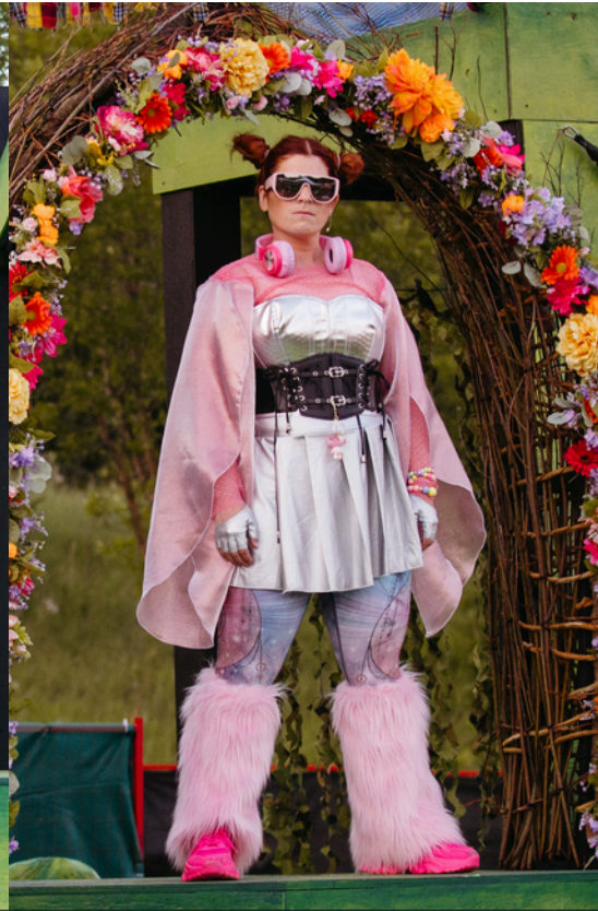
This is HYMEN